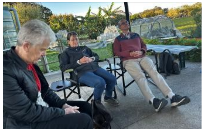
More St Paul's folk Gazing at the Garden in the Season of Creation at Bethania Street