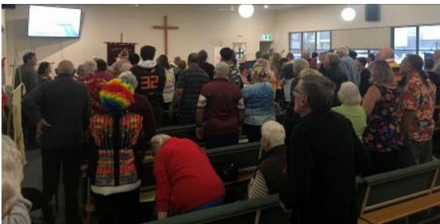
Cursillistas at the closing celebration of Weekend #83 in the Coolum Uniting Church.

The Cursillo weekend itself was a wonderful uplifting experience. The Holy Spirit was an active participant, and many participants (including the team!) experienced spiritual growth. It is a joy to watch the real transformation in people that can come from doing a Cursillo weekend. As intended by the program, many people are inspired by what they learn and go on to greater Christian leadership in their local environments. Some people, over the years, have even been called to the priesthood through their attendance at Cursillo.