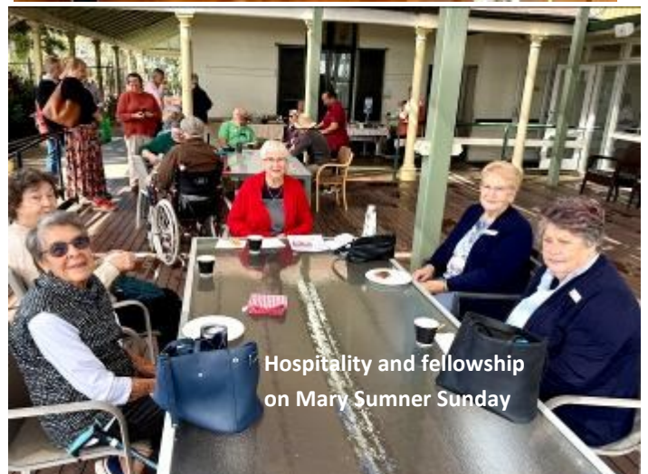
Hospitality and fellowship on Mary Sumner Sunday