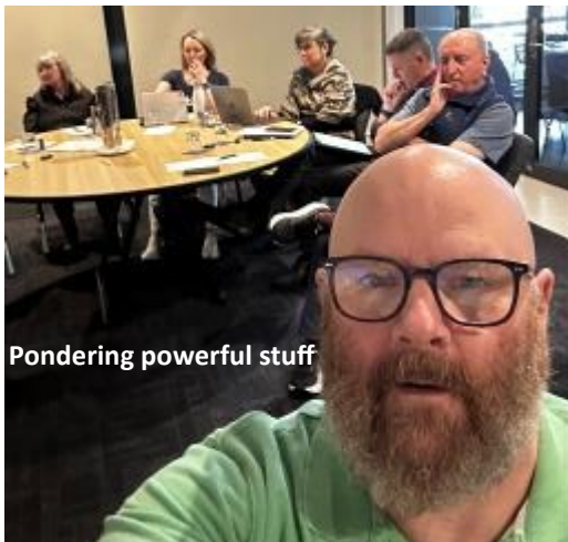
Pondering powerful stuff