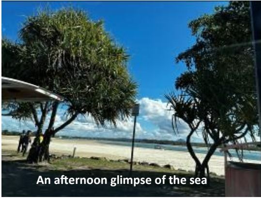
An afternoon glimpse of the sea