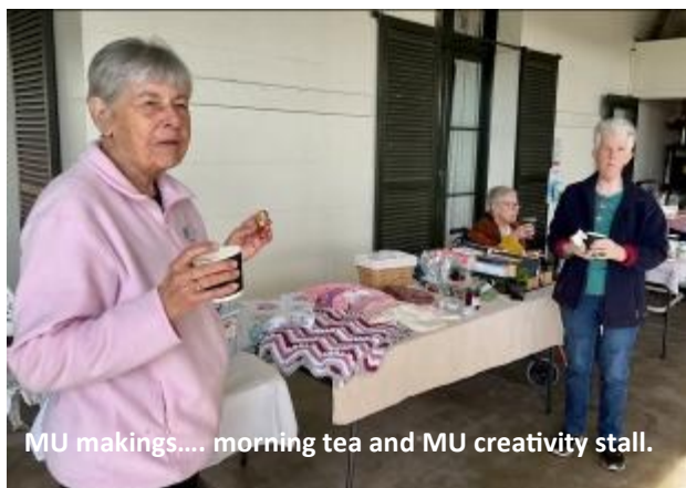
MU makings.... morning tea and MU creativity stall.