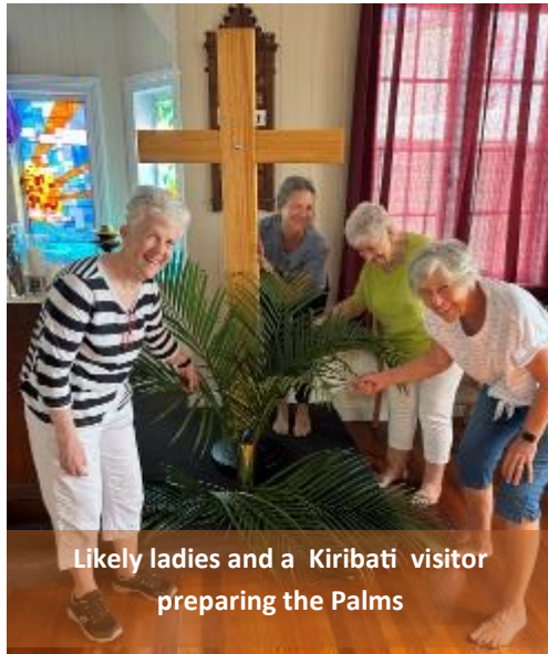
Likely ladies and a Kiribati visitor preparing the Palms

We were so pleased to pick up our new standing cross just in time for Palm Sunday. Lovingly constructed with only three days warning by the fellas at Wynnum Manly Men's Shed, the cross uses timber from the pews from the Lota House Chapel. The men designed and built it with a solid sturdy base they recycled from a fan, making it easy to assemble, store and stand strong and stable for many years to come.