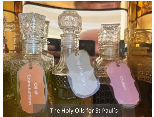
The Holy Oils for St Paul's