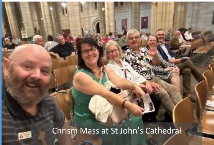
Chrism Mass at St John's Cathedral