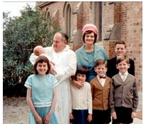
Baptism Day with Dad and Family and a lifelong love of cake.