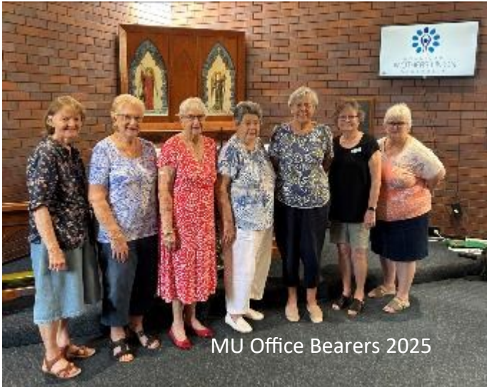
MU Office Bearers 2025